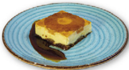
Pineapple cake 5,00€