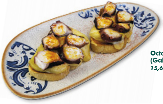
Octopus and tetilla cheese (Galician cheese) toast 15,60€