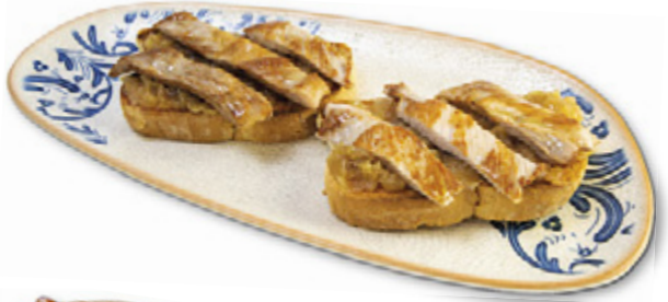
Special pork fillet and caramel coated onion toast 8,20€