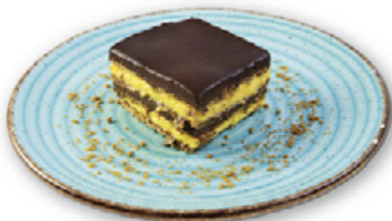
Grandma's cake 5,00€