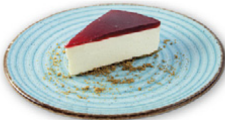
Cheese cake 5,00€