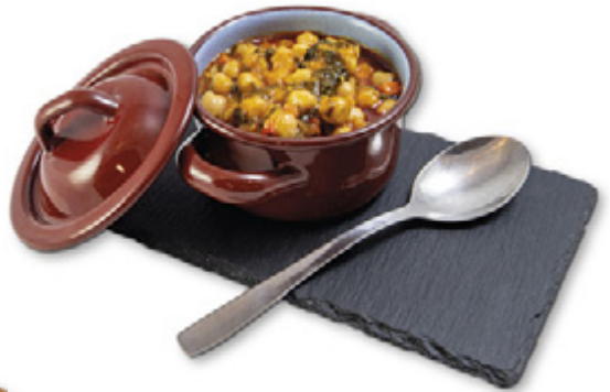
Vegan stew 7,50€