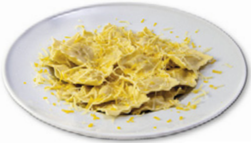
Ravioli filled with beef 8,90€