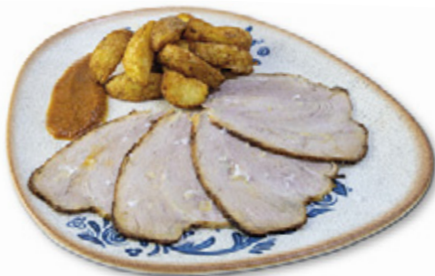
Special pork fillet with chips 9,60€