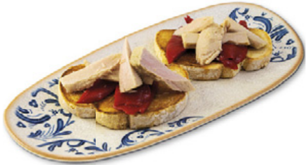
Northern white tuna and roasted peppers toast 9,80€