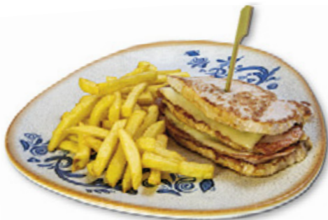
Loin, bacon and cheese millefeuille 8,90€