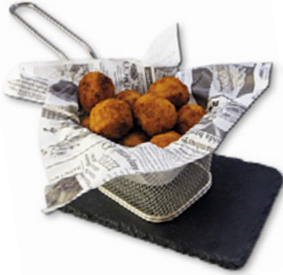
Iberian ham or cured meat croquettes 7,50€