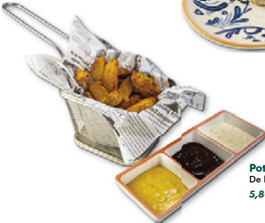
Potato wedges 3 sauces De luxe, barbecue and mango/curry 5,80€

The photos are just a serving suggestion. These products may be replaced by others with same or higher quality