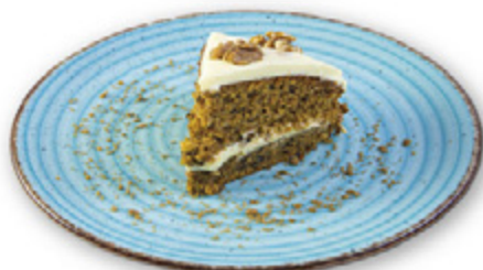
Carrot cake 5,00€