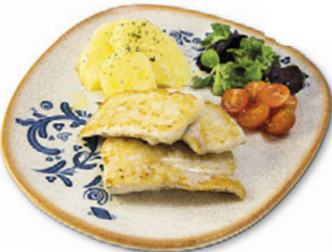
Hake loin with boiled potato, salad sprouts and cherry tomato 13,40€

The photos are just a serving suggestion. These products may be replaced by others with same or higher quality