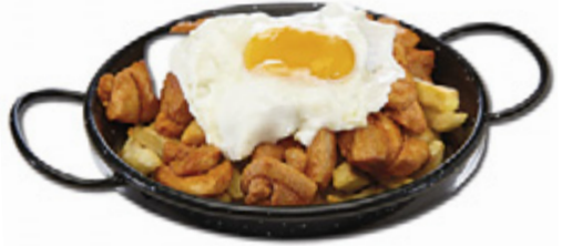
Marinated chicken with chips and egg 7,70€